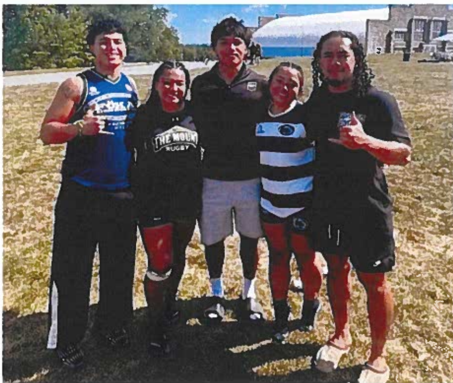
GUAM SPORTS NETWORK