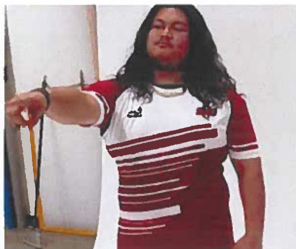
GUAM SPORTS NETWORK

For more information, please contact the Board office at 735-7404/10 thru 12. Persons needing a telecommunication device for the Hearing/Speech Impaired (TDD) may contact 475-8339.